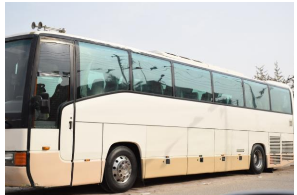
2- Shuttle used for student services

Shuttle service is partially provided by the university according to the college budget. For the students that stay in the university housing, the shuttle service is available and free. In other hand, the student that lives far of the colleges, the travel service is not free and provided by other parties. Sometimes the university contributes a part of the cost for students and staff.