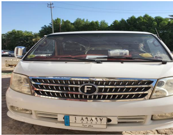
1- Minivan used for staff services