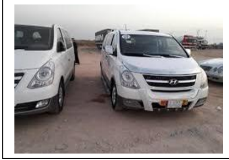
3-minivan used for staff services